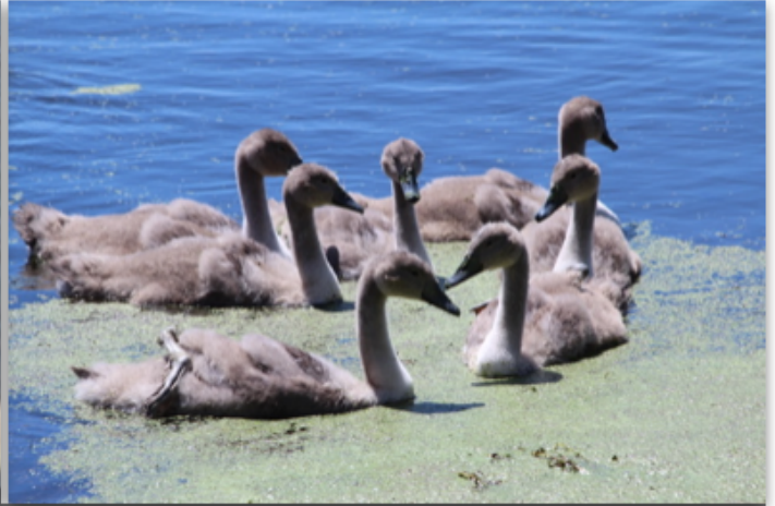
Above left: A family of swans makes its way through the spring water. Above right: Seven of the eight cygnets have survived!